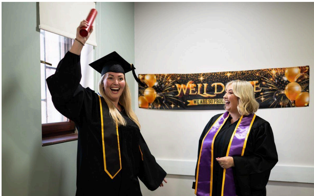
Celebrating our graduates — a moment of pure joy!

Meeting the requirements of the course, as outlined in this handbook, will normally lead to the award of Level 5 Diplomas in Integrative Counselling and Clinical Hypnotherapy.