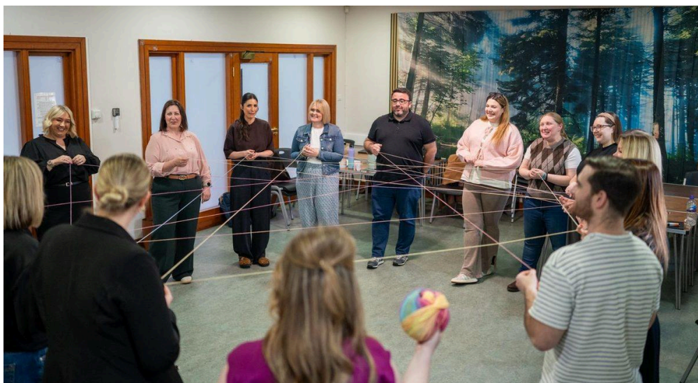
The web of connection

At UK Therapy Guild, everything we do is shaped by both lived experience and a deep belief in the possibility of change.